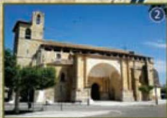
Church of San Pedro. Provincial Museum.