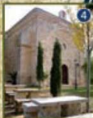
Ermita del Otero.