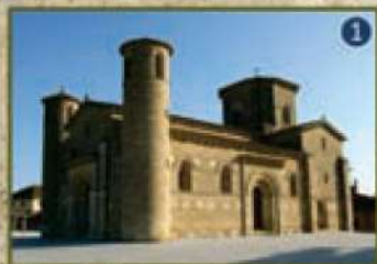
Church of San Martín